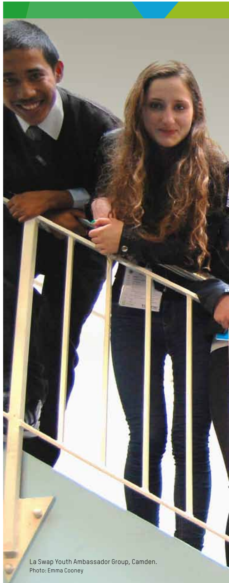
La Swap Youth Ambassador Group, Camden.

Wherever you are in the process, you can come along to our Annual Review Meeting, joining other World Shapers schools to share learning, celebrate your achievements and make plans for the year ahead.