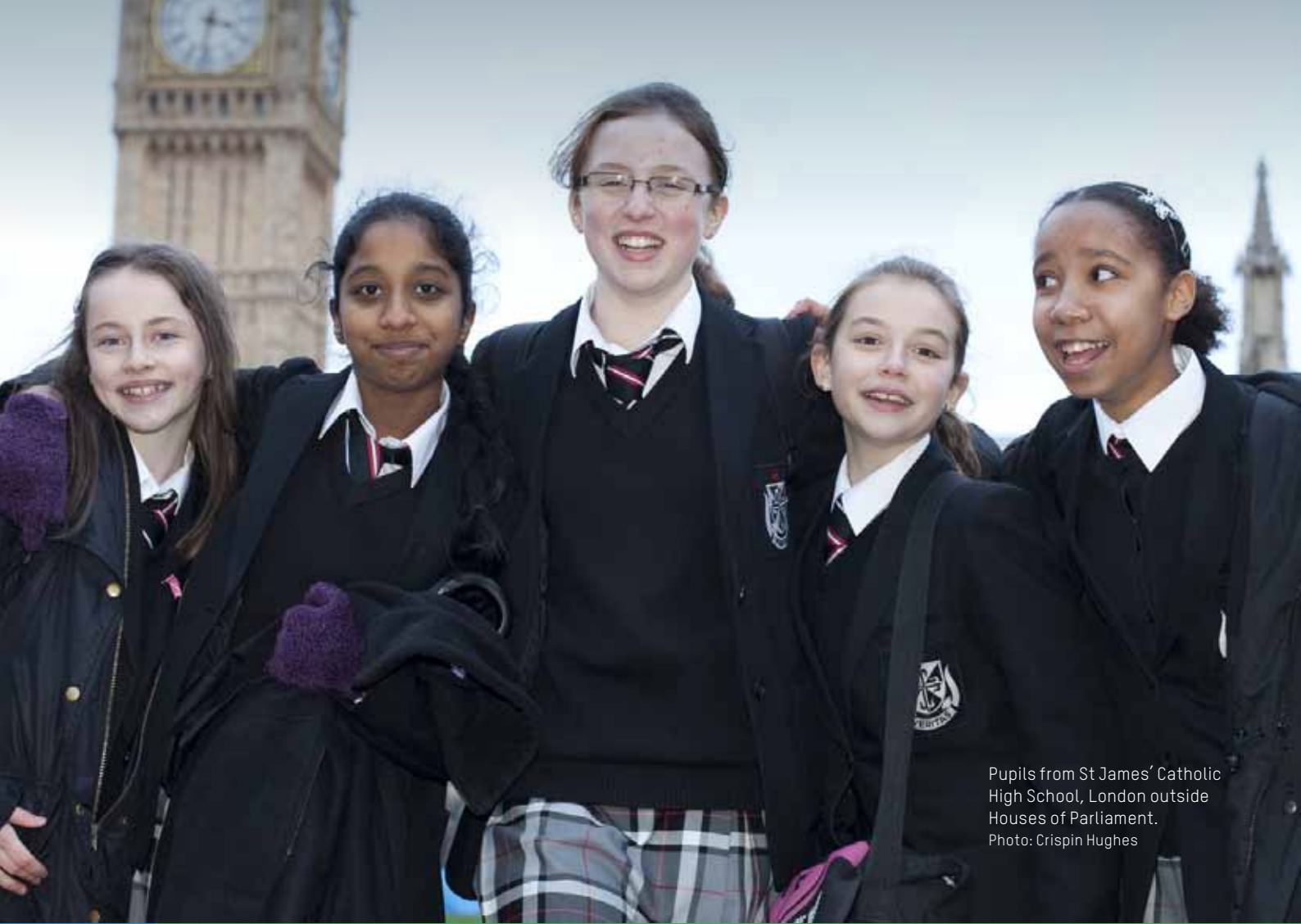
Pupils from St James' Catholic High School, London outside Houses of Parliament.